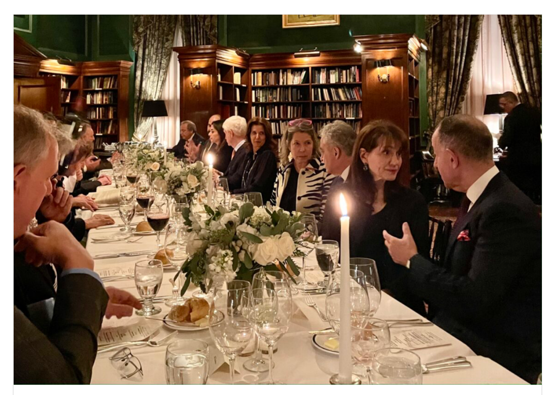
FIAC table at Raquet & Tennis Club, New York

This confirms the great commitment of FIAC, a nonprofit organization founded in New York in 2003, in promoting Italian cultural and artistic traditions from the classical to the contemporary period in the United States.